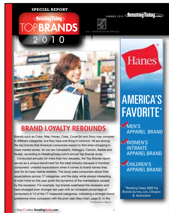
State of the Industry Reports